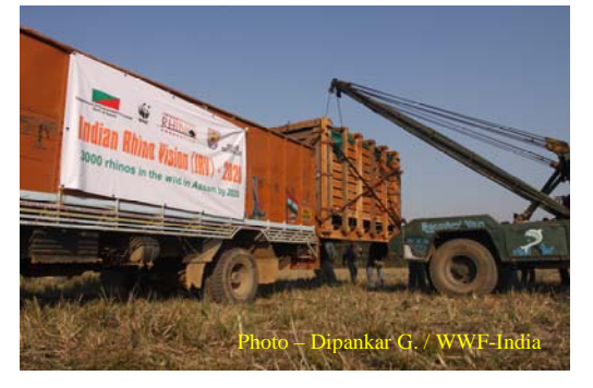
Plate4 – Loading of the crates with the rhinos

On the convoy reaching Manas the release team who made all pre-arrangements for the release took over. Two ramps were prepared for parking the trucks for the release near Buraburijhar camp. The crate with the calf was unloaded from the truck to be placed close to the crate of the mother so that they can come into contact easily. The plan was to release the rhinos when the visibility was good at about 8.00AM. The door of both the crates was opened together at about 8.15AM so that the rhinos get the chance to come out simultaneously. The calf came out first at about 8.28AM and moved towards the mother and both came very close and then moved northwards towards the grasslands. The mother also came out at the same