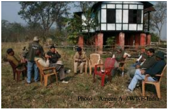
Plate1 – Preparations in progress