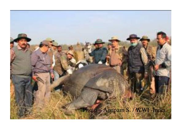
Plate 3 & 4 – Part of the Pobitora Capture team

On the convoy reaching Manas the release team under the leadership of FDTP Manas took over charge and made all the necessary arrangements for the release. The two trucks with the rhinos were taken inside for release in the interior area near Buraburijhar camp where the rhinos were released during the previous rounds. Here two ramps were prepared for parking the trucks for the release of two rhinos simultaneously. The rhinos were transported with their face towards the front and so at the time of release the crates were downloaded with the help of a crane so that the rhino's could come out easily with their face towards the front. The keys to the lock of the crates were handed over to the Leader of the Manas team jointly by the Leader of the Transport team and Forest Range Officer, Pobitora WLS. The crate door for the first rhino was opened at about 8.30AM. The rhinos were applied with mild sedation and it walked out in the north-eastern direction quite soon without much delay. The door for the next rhino was similarly opened at about 9.00AM, this rhinos was a bit bigger and more aggressive, and it took a few rounds of the release site providing each one observing a nice view, attacked the crane once and went off to the grasslands in a northern direction. Thereafter the released rhinos were monitored closely by the monitoring team. Both the rhinos had only superficial injuries at the time of release and necessary medication was applied prior to their release in the wild.